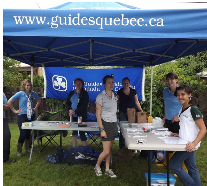
Pointe-Claire Family Fun and Safety Day, September 6, 2014

Units in Saint-Bruno held a registration event with some tasty treats and lots of goodies!