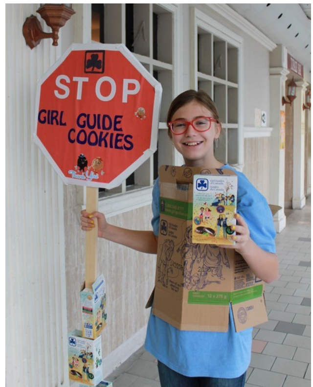
Top left and above: Pointe-Claire cookie sellers; Left: Cookie sellers from Northern Lights District.