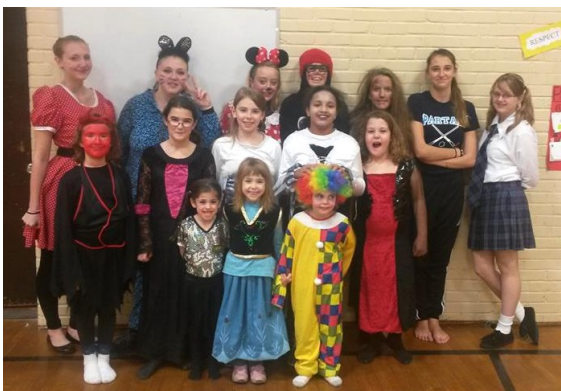
Above: Halloween in Laval; Below: Celebrations in Valleyfield

Clockwise from left: Valois-Dorval Girl Guides; Secteur Argenteuil Girl Guides; Pointe-Claire Girl Guides