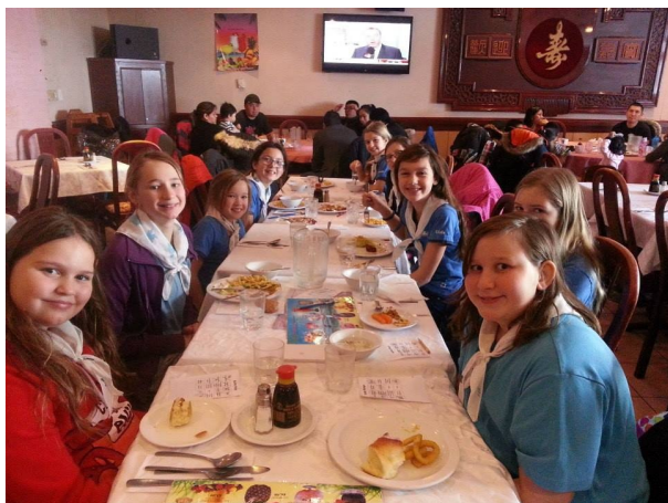
Lunch Bingo in Chinatown

“We visited Bonsecours market, Chinatown, the underground city, and the Christmas lights on McGill College Avenue, and then a train ride home!” - Valois-Dorval District Facebook Page