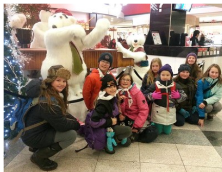
(Above) A stop to warm up at Place Ville Marie