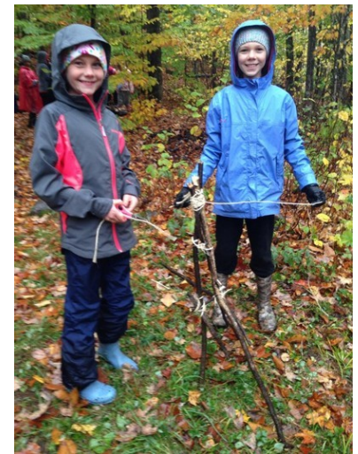
Guides from Riverdale District

On Iroquois/Montagnais, the Guides started their day with a wide game where they had to be very quiet and stalk animals (aka Guiders pretending to be specific animals) in the forest. Many of the "animals" were well hidden and it was a great challenge to find all 20 of them! In the afternoon, there was a round robin of activities for the Guides to choose from. The selection varied from making/testing fire starters, cooking bannock, learning knots, super camp gadgets, various nature activities and a scavenger hunt, charades, bug hunting and more.