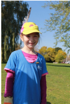
More photos on the blog!

Pointe-Claire District roll up their sleeves for their community shoreline clean-up