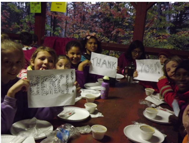
Guides at Algonquin, Fall Day Camp 2014.

Looking for other ways to contribute? Learn more about the ways to donate on the ‘Ways of Giving’ page of our Quebec website .