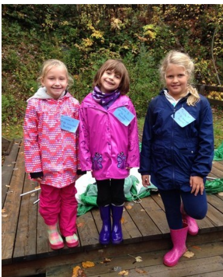
Riverdale District Brownies

The next day was the Camp Closing . A dedicated group of Guiders stayed up at camp Saturday night and were joined on Sunday by more Guiders, friends and family to help close up camp for the winter.