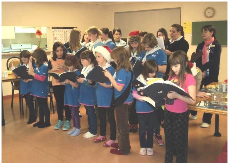
Ormstown Girl Guides sing Christmas carols at their local seniors centre

Liesse District is looking for another group that would be interested in joining them for their winter camp at Cap St-Jacques, January 24-26. It is a fantastic location for a camp, with great accommodations as well as activity animation. If anyone is interested (any level - they have Brownies, Guides and Pathfinders), please contact info@guidesquebec.ca and we'll put you in touch!