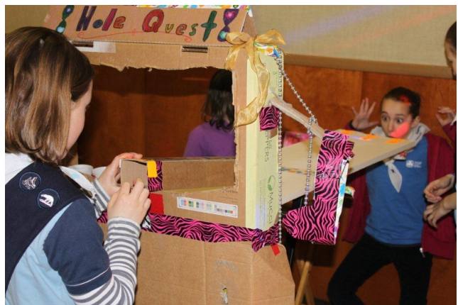
Valois-Dorval Girl Guides at their nickel arcade fundraiser for the Canadian World Friendship Fund