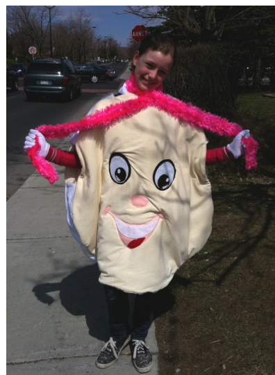
1st Mount Bruno Pathfinders at their Cookie Drive Thru fundraising event