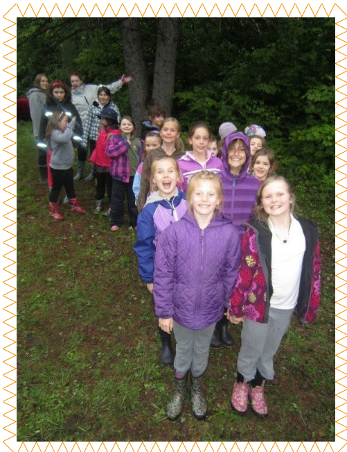
Campers from Secteur Argenteuil all lined up and ready for the hike to Iroquois