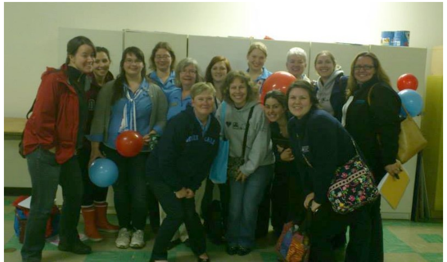
Understanding the Adult Learner trainers and trainees at the June 7 session in Lachine