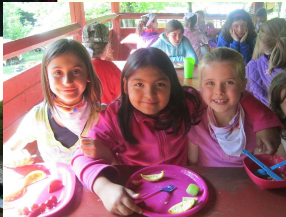
(above) Secteur Argenteuil Girl Guides starting off the day at Camp Wa-Thik-Ane, Morin Heights

(left) Third year Guides, Pathfinders and Trex take part in a sound workshop offered by the International Congress of Acoustics and the Acoustical Society of America at the Palais des Congrès in Montréal