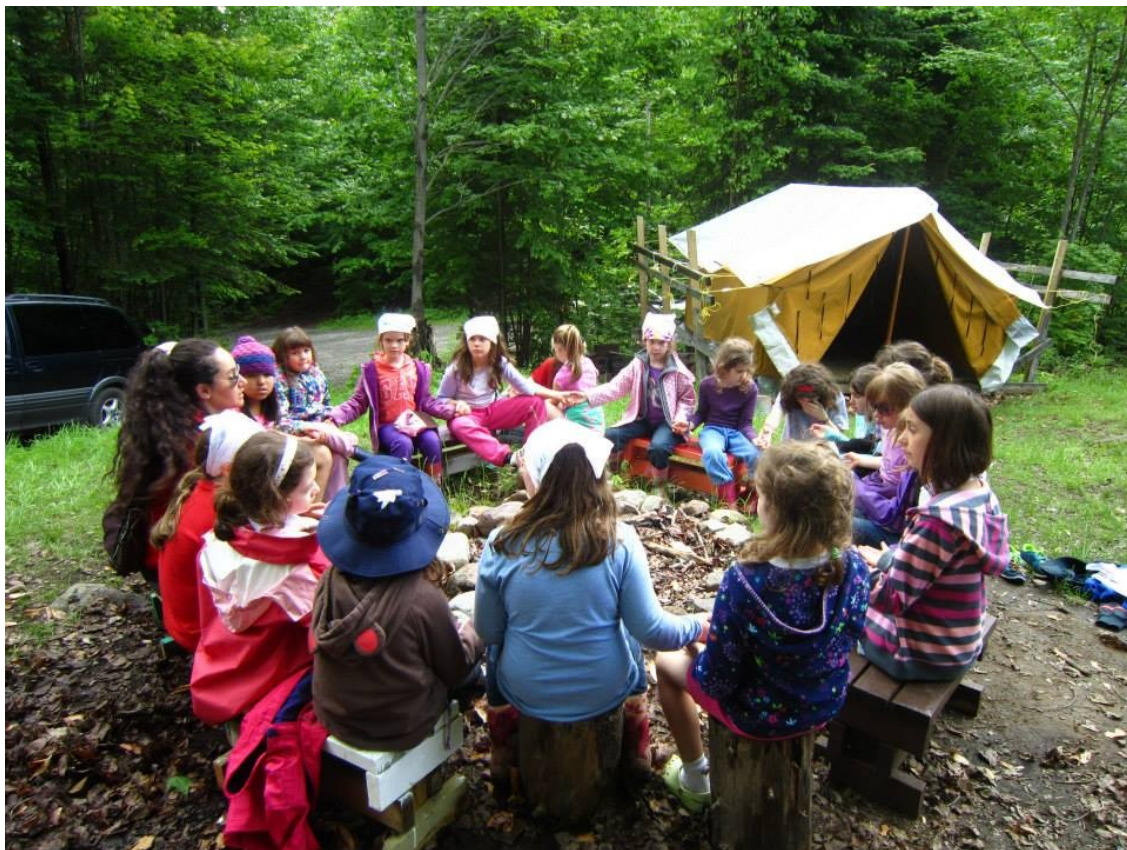
Precious shared moments at Camp Wa-Thik-Ane