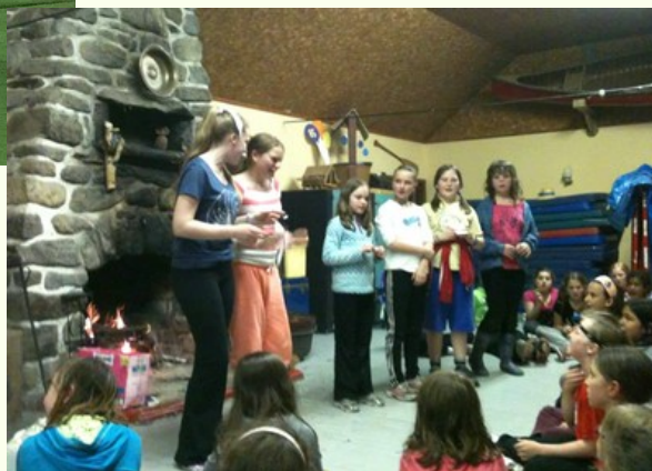
(right) 1st Lachute Pathfinder Unit lead a song at central campfire in Stavert Lodge

www.guidesquebec.ca guidesquebec.wordpress.com