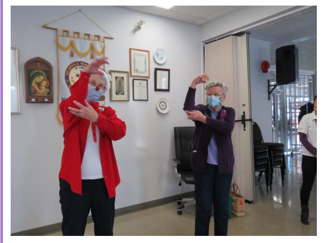
Five Gold Rings