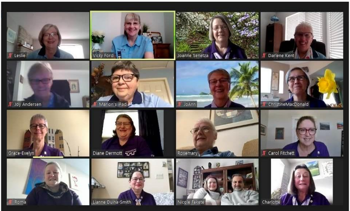
A screenshot of some of the attendees ~