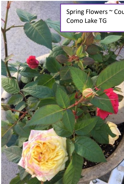
Spring Flowers

Welcome to the Spring Edition of our Bulletin. "Spring adds new life and new beauty to all that is!!"