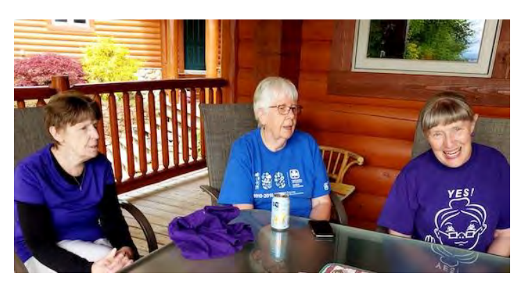
It was a beautiful day to sit out on the deck and sing along with the PowerPoint campfire.