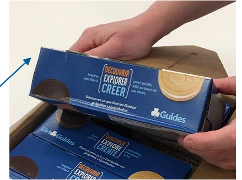
Crushed or punctured boxes