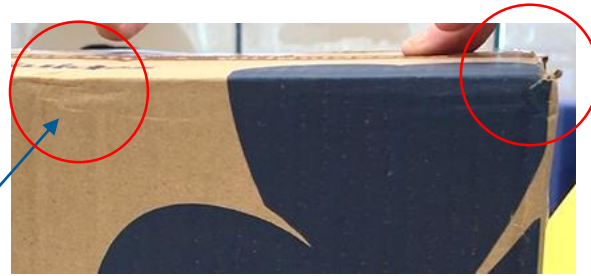
Dents & tears in the case