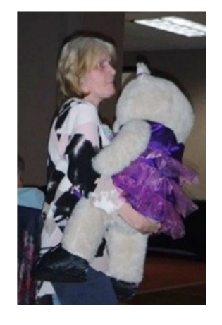
Fun and Friendship at the Banquet