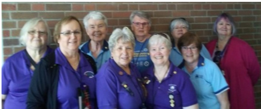
Delegates at National Gathering Sudbury. Oh what FUN we had and the memories!!!!