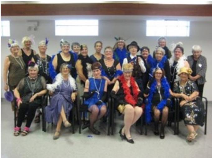
Saturday theme was “The Roaring Twenties”