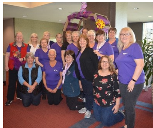
Look at our cool Girl Guide Socks!