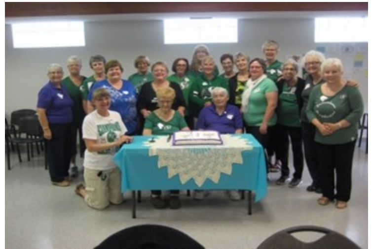
Rider Day – all in green