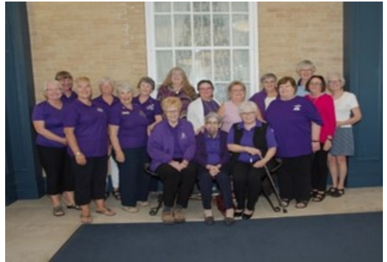
Sunday afternoon tea at Government House