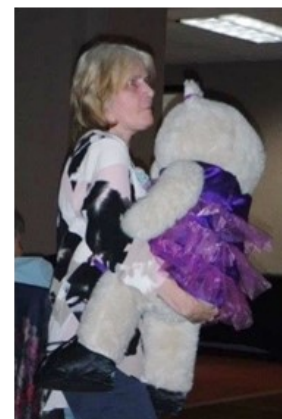
Fun and Friendship at the Banquet